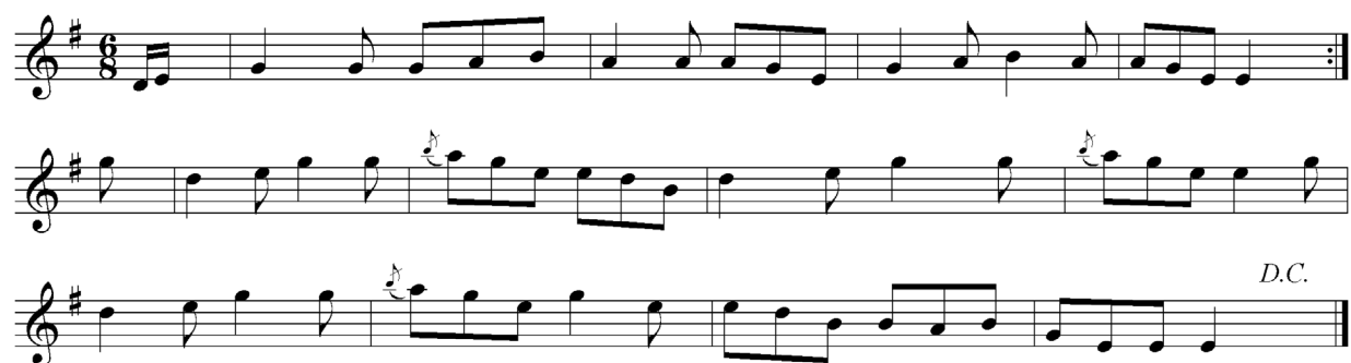
Fig. 8: "Wi the Apron On" (Greig-Duncan 471D).

presented in Riddell's tune, or simply a repetition of the first part for the refrain. The close melodic correspondence overall tells us that only one tune was being used for this song. The tune bears similarities to that of Greig-Duncan 1088, "Irish Mally O," and thus seems to have been used for a range of songs, one of them being this Masonic one.